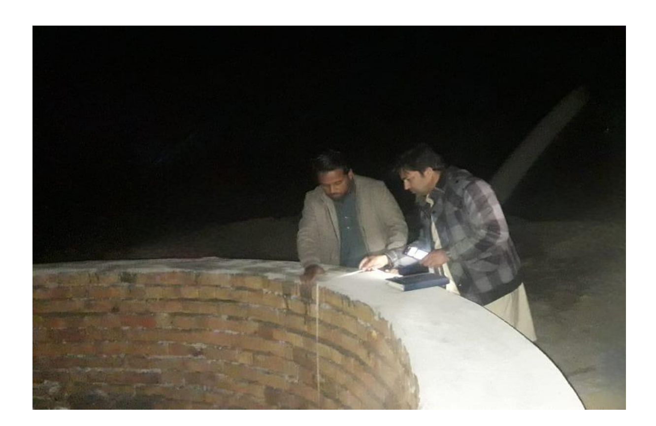
Figure 1: Field visit of Punjab during the month of January 2024