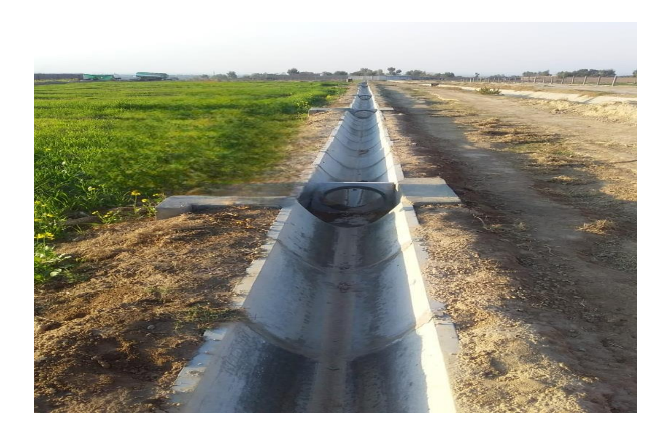
Figure 3: Field visit of Khyber Pakhtunkhwa during the month of January 2024