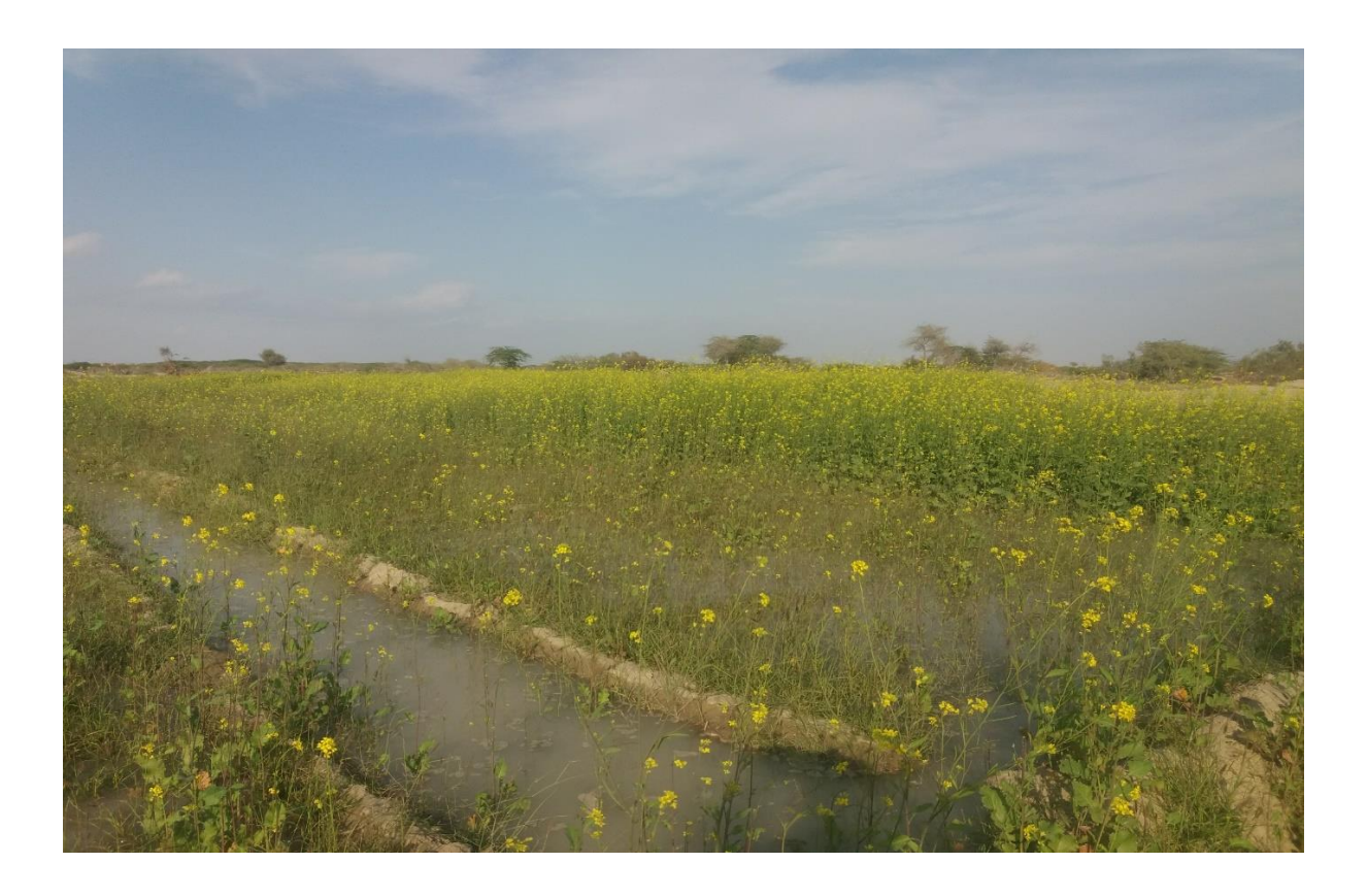
Figure 2: Field visit of Baluchistan during the month of January 2024