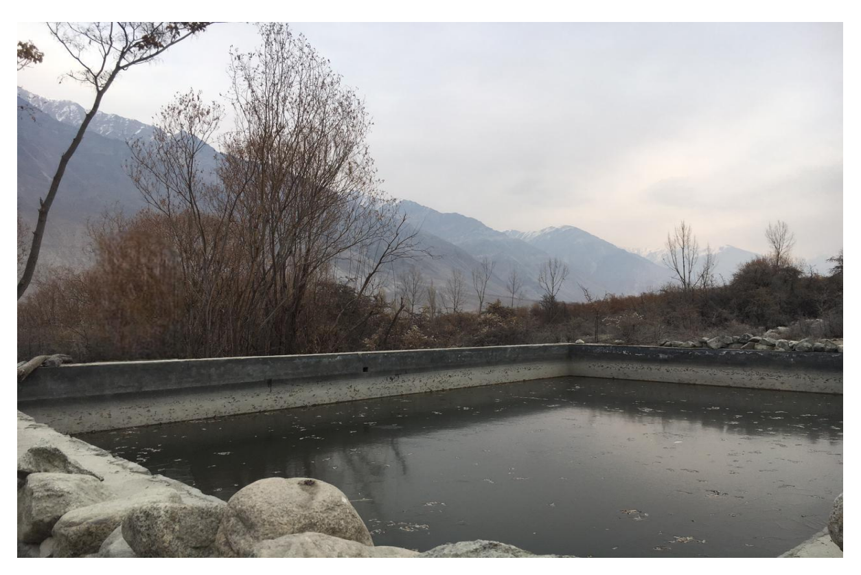
Figure 4: Field visits of Gilgit Baltistan during the month of January 2024